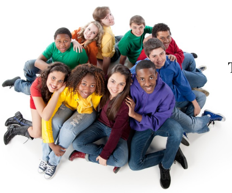
Brand new clothing will be available to all attendees.

All you need to know about: Foster Care Eligibility Payments Resources for Caregivers Upcoming events/conferences