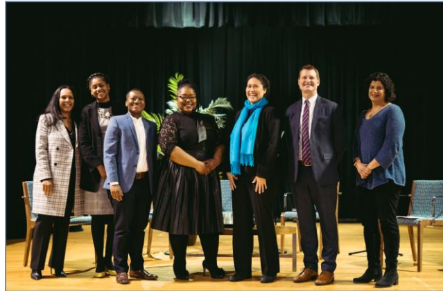
SFHSA Town Hall on Racial Equity in February 2020

This year, APS began implementing the Trauma-Informed Systems (TIS) framework, a public health model for organizational change and trauma-informed practice that enables us to respond more effectively to each other and the people we serve. The implementation process is being guided by the program's staff-led Healing Organization Workgroup, which began convening monthly in late 2019. The workgroup administered a baseline survey to APS staff in February to identify the program's strengths and areas for growth. Since then, the workgroup has been processing the survey results and determining priority areas in which to focus the program's TIS efforts – particularly in light of operational challenges posed by the outbreak of COVID-19, and the ways in which the pandemic may exacerbate existing traumas and generate new ones among our clients and workforce, alike.