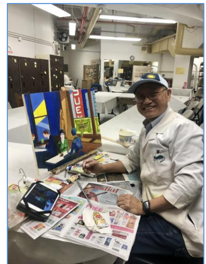
Art classes at the Aquatic Park Senior Center

Collectively, DAS staff and community partners conducted approximately 30,000 wellness calls as part of the emergency response to the COVID-19 outbreak. Prioritizing current clients at highest risk – such as those 80 years or older, living alone, and/or with significant personal care needs – staff made calls to ensure people were aware of public health directives such as Shelter in Place, their essential needs including were being met, and they knew the DAS Benefits and Resource Hub was available to provide information and other support if needed. The DAS Hub reached out to over 190 individuals in need of additional follow-up, but who lacked the capacity to call the helpline themselves. Data collected from these calls helped to identify trends in unmet needs, and has helped to inform planning for supportive aging and disability services during the pandemic response.